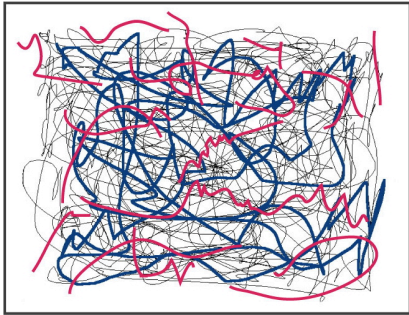
From Chaos ...